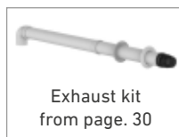
Exhaust kit from page. 30